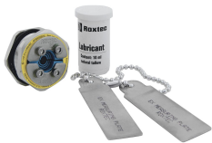
C RS T Ex seal